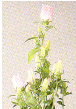
2-3 flowers in bloom