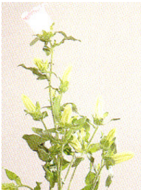
1 flower in bloom